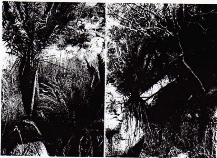
Figures 1, 2. Encephalartos barteri subsp. allochrous on Kaldo Peak, Nigeria. Old plants, with long trunks and basal branches (at right). Pick length=71 cm. Fig. 1 Trunk 1.5 m long, supported by rock. Fig. 2 Trunk 2.0 m long.

E. barteri rarely exceeds about 0.3 m in length (Prain, 1917; Keay, 1954; Hall & Jenik, 1967), and strong contractile roots pull down the trunks so that much of this length is often below ground. Melville (1958) gives a trunk height of 0.3–1.5 m for E. barteri in Uganda. However, Heenan (1977) reports that no trace of this species was found during an intensive search in north-east Uganda, and suggests that E. barteri is restricted to West Africa. In his discussion Heenan mentions only one of the two records cited by Melville, but both were from the same general area in which the search was conducted.