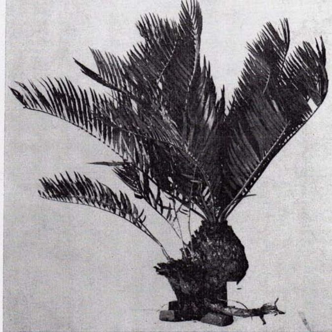
PLATE 2. — Encephalartos cupidus , young plant producing suckers from base (PRE 30546c).

smooth; lower facet receding more or less at right angles from the terminal facet; terminal facet irregular in shape; 2.5-3 cm broad, 1.5-2 cm wide vertically, fairly smooth, with slightly raised rim; seeds immature.