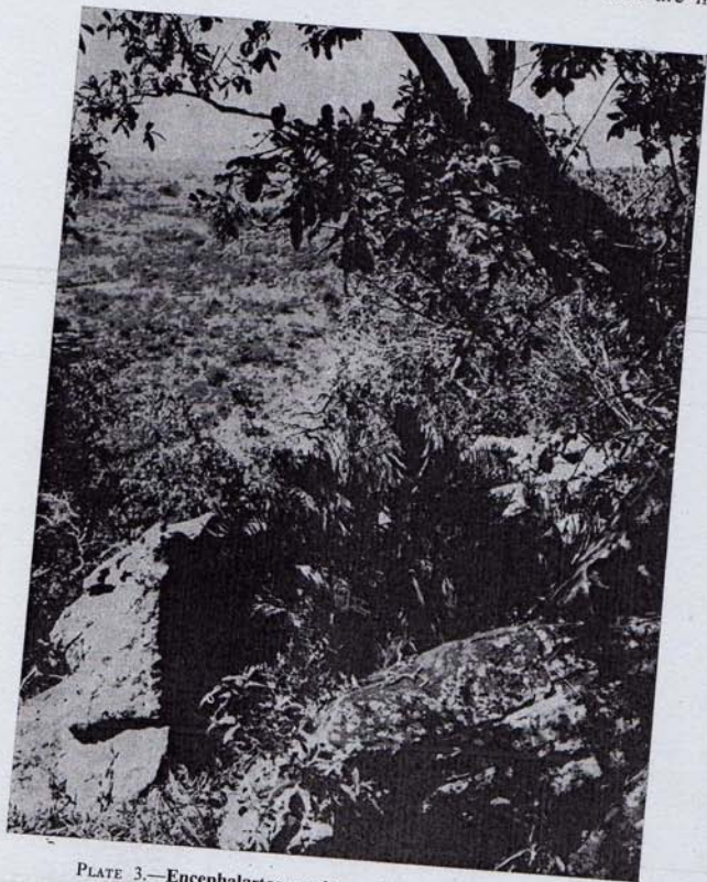
PLATE 3.— Encephalartos cupidus , plant in natural habitat in Blyde River Nature Reserve, Eastern Transvaal.

Between Mr. van Heerden and Nature Conservation Officers of the Transvaal Province, and Dr. Leistner of the Botanical Research Institute, sufficient material has been made available for a fairly full description to be prepared. So far, however, only 2 immature female cones have been seen. They agree closely in essential characters and have a conspicuously large terminal facet to the scales. These, together with its dwarf habit, somewhat glaucous leaves and strongly prickly leaves, distinguish the species from among its southern neighbours. On the characters mentioned, its nearest relative appears to be E. munchii Dyer & Verdoorn, described from south of Vila Pery in Mozambique. The latter species, however, has far larger cones, the males of which are more than one on a plant, tall and lax.